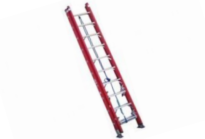
Single or Extension Ladder