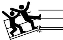
Collapse cause by instability or overloading