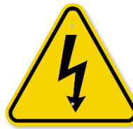
Electrocution from overhead power lines