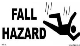
Fall from scaffold